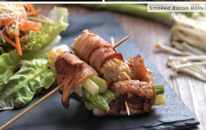
Smoked Bacon Rolls

Mix of fresh prawns, fish, clams, squid & mussels cooked in white wine, garlic, butter & tarragon broth. Served with garlic bread.