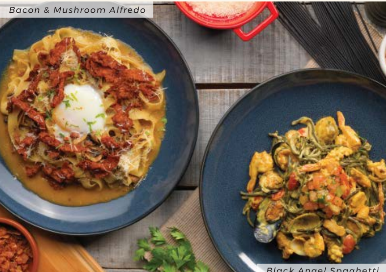
Black Angel Spaghetti