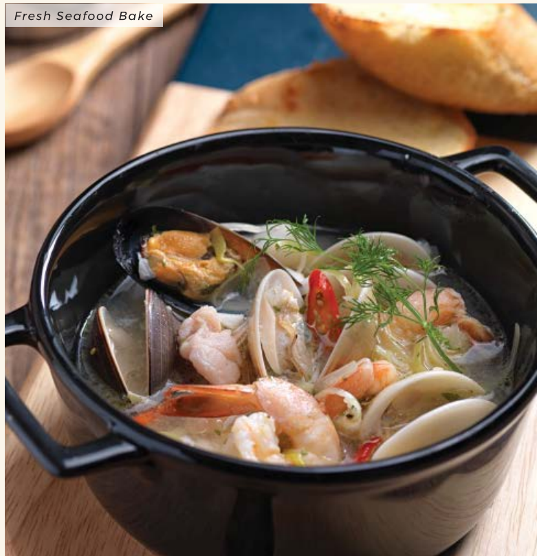
Fresh Seafood Bake

Koshihikari rice cooked with portobello mushrooms, truffle oil & parmesan