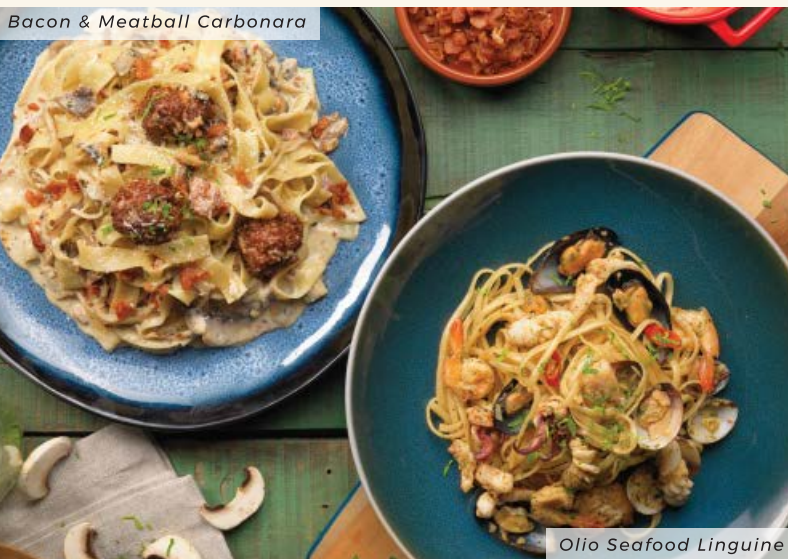
Olio Seafood Linguine