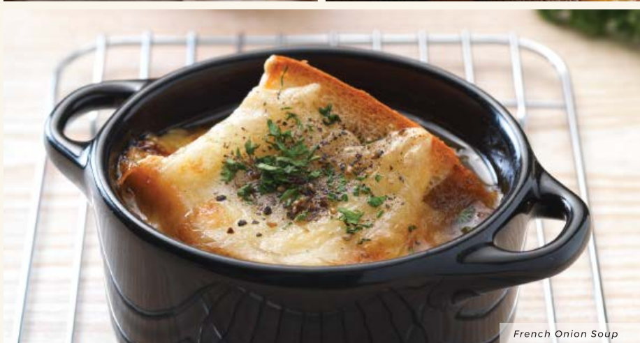
French Onion Soup