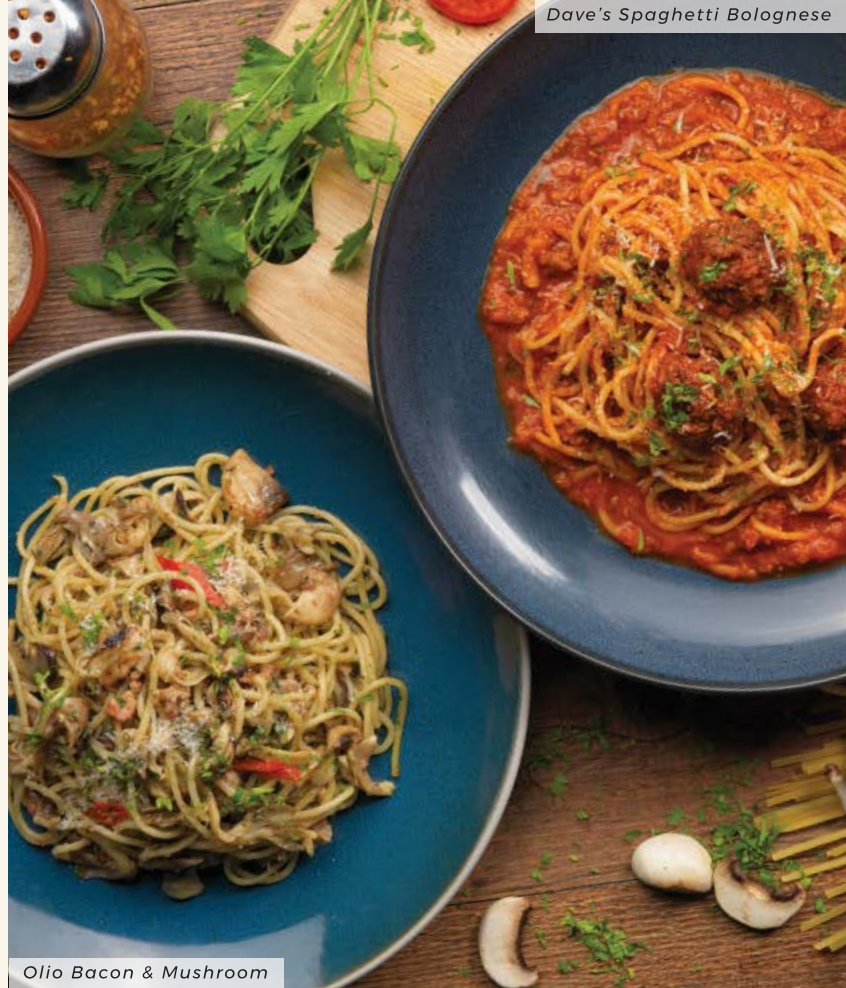
Olio Bacon & Mushroom

Our best selling cream sauce fettuccine pasta with smoky bacon, house-made meatballs & button mushrooms. (creamy)