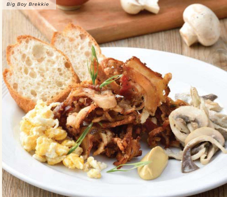
Big Boy Brekkie

Our signature roast pork shaved & pan fried until crispy. Served with creamy mushrooms, scrambled eggs, roast gravy & 2 sliced of toasted baguette bread.